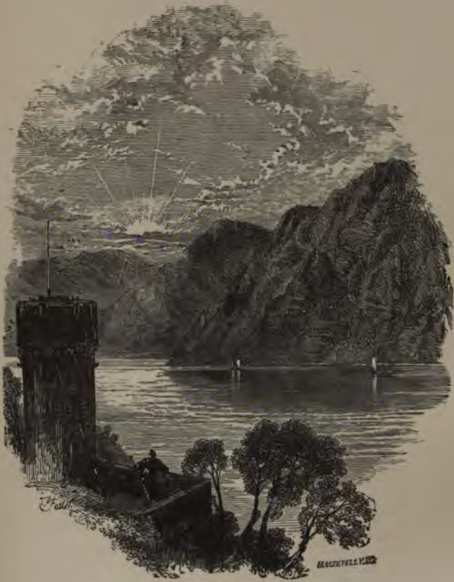
"Loch-Katrine lay beneath him rolled." Page 106.